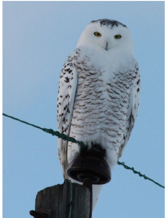
A snowy owl perches on a telephone pole.

This was an educational field trip for new and intermediate birders. Covering winter ecology of bird life, bird identification skills, and the impact of bird tourism in the EUP. Session held January 11, 2020 with 12 participants.